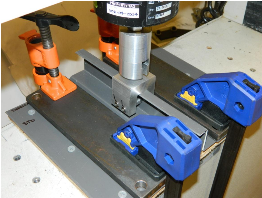
Fig. 2 - The uplift test setup is shown.