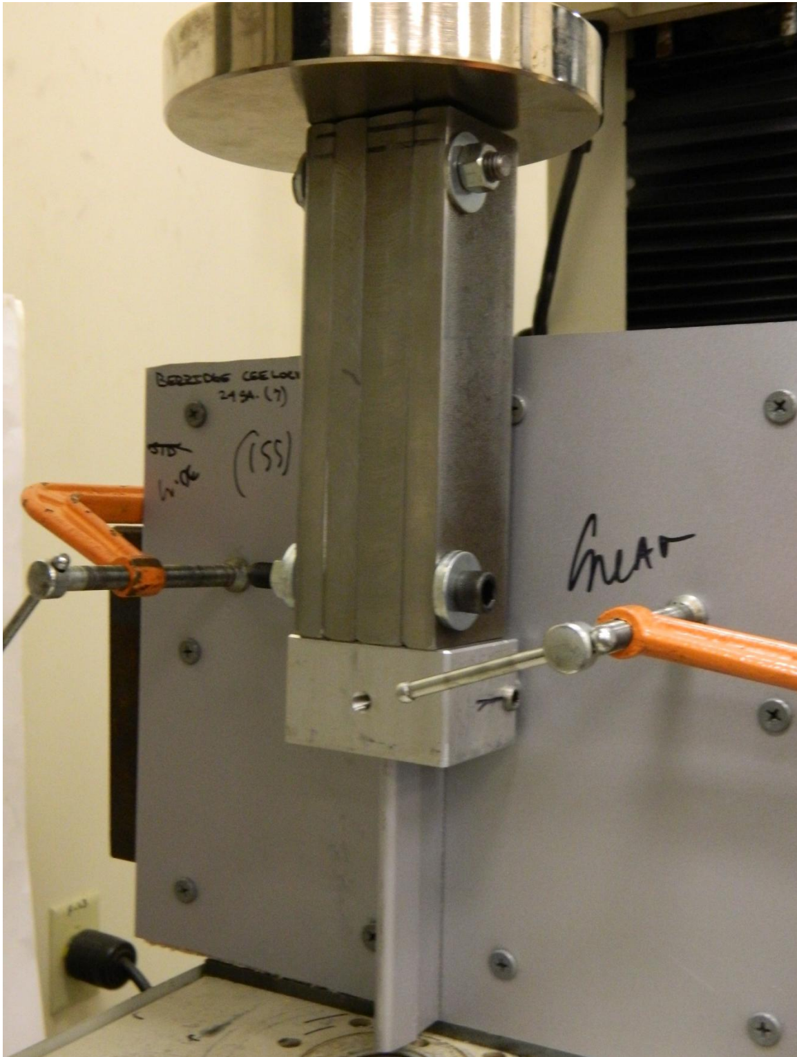
Fig. 3 - The shear test setup is shown.