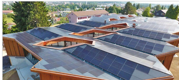
Commercial hall, hospital, residential and school building