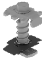
CrossRail Mid Clamp