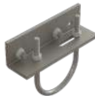
GM Adjustable L-Bracket