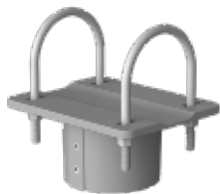
GM Top Cap